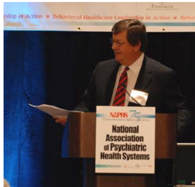
Rep. Jim McCrery.